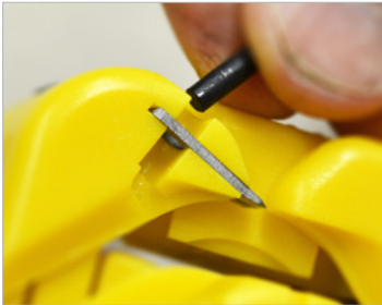
Fixed stainless steel blades require no adjustments and replace easily.

For more information or to locate the nearest authorized Ripley® distributor, please visit www.ripley-tools.com or call 1 (800) 528-8665 to speak to a customer service representative.