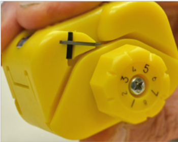
Spring-loaded design eliminates need to lock or clamp tool while in use.